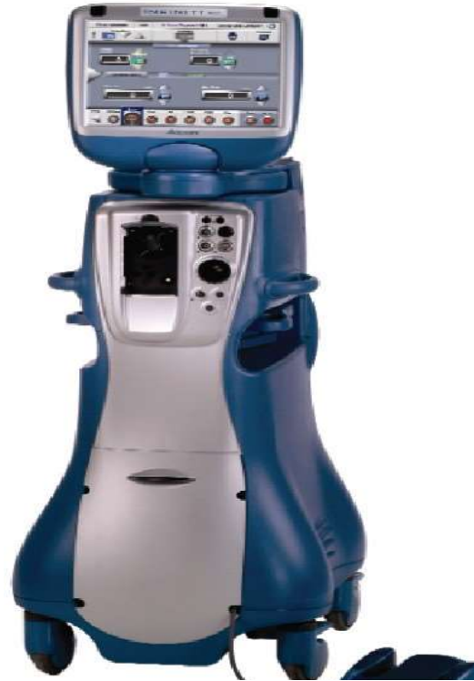
Alcon Infinity Phacoemulsification machine

We at Sanjeevani eye hospital do most of our cataract surgeries under topical anaesthesia that is without an injectable anaesthetic. The surgeries are done using Infinity Phacoemulsification machine by Alcon. The infinity machine uses ozil technology to emulsify and remove the cataract. After removal of the cataract, a foldable lens is implanted through a self-sealing sub three millimetre incision.